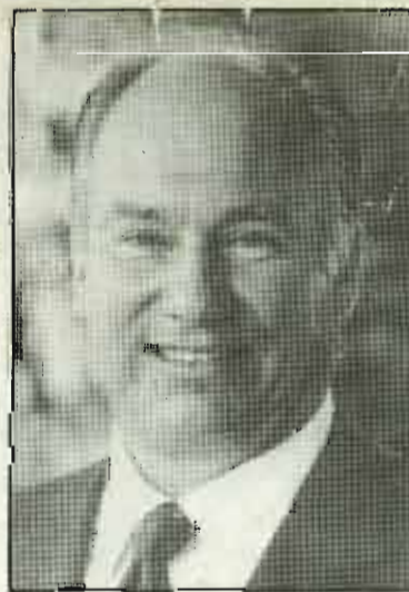
The Aga Khan said that the task of the Award was "to build a space for reflection and debate on the meaning for Architecture of these patterns

"Muslim Societies" said the Aga Khan, "are having to confront complex patterns and pressures of changes. The nine projects, demonstrate that these pressures can be a source of creativity and opportunity".